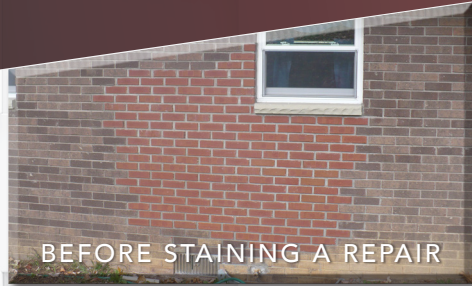
BEFORE STAINING A REPAIR