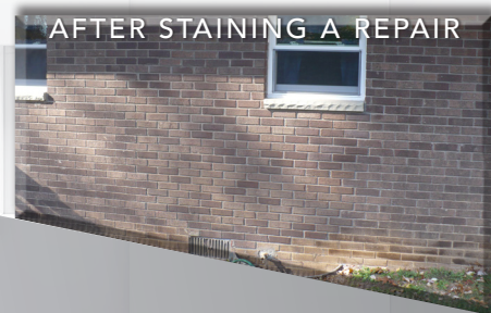
AFTER STAINING A REPAIR

When restoring a building to its original beauty, choose a lifetime stain over the costly solution of replacing the brick